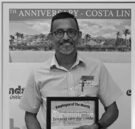
Costa Linda Beach Resort