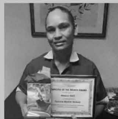
Aruba Beach Club Resort