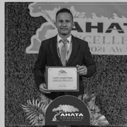
AHATA Excellence in 2021 Award