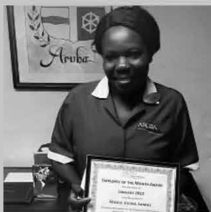
Aruba Beach Club Resort