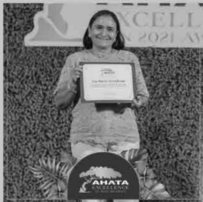
AHATA Excellence in 2021 Award

Maintenance Man - Boardwalk Boutique Hotel