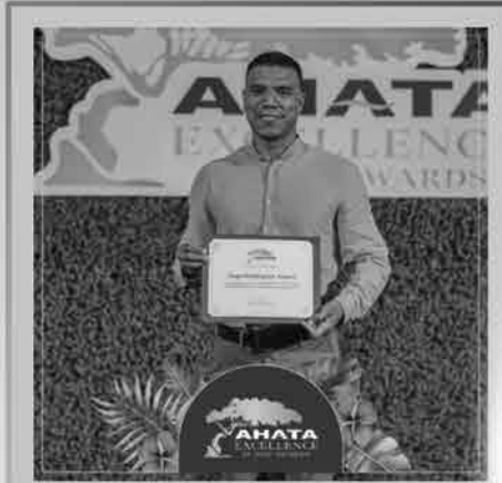
AHATA Excellence in 2021 Award