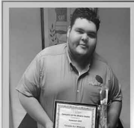
Aruba Beach Club Resort

Senior Maintenance Technician - Bucuti & Tara Beach Resort